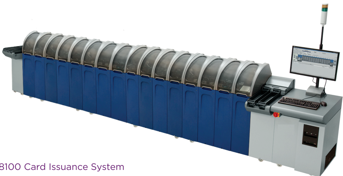
MX8100 Card Issuance System

Service and support: The MX Series Platform is supported by the industry's largest service and support network, which spans more than 150 countries worldwide. Online and phone support is available 24/7.