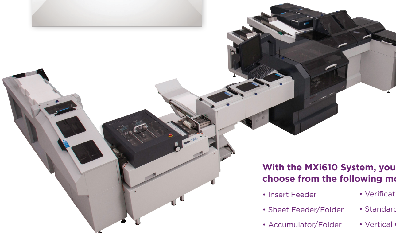
MXi610 Envelope Insertion System