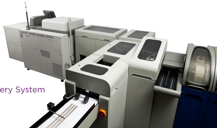
MXD611 Card Delivery System

Support market trends: Meet the growing vertical card trend without limiting job sizes based on card orientation. Dynamically place cards on carriers horizontally and vertically to meet customer requests.