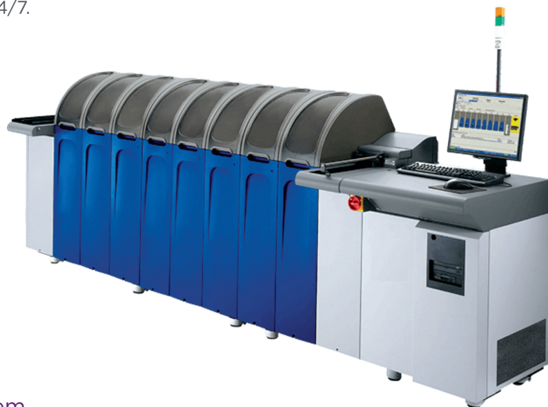
MX6100 Card Issuance System

Service and support: The MX Series Systems are supported by the industry's largest service and support network, which spans more than 150 countries worldwide. Online and phone support is available 24/7.